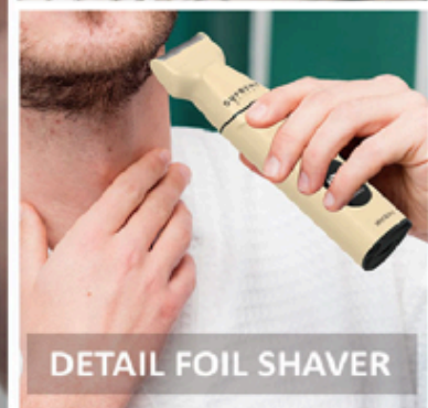
DETAIL FOIL SHAVER